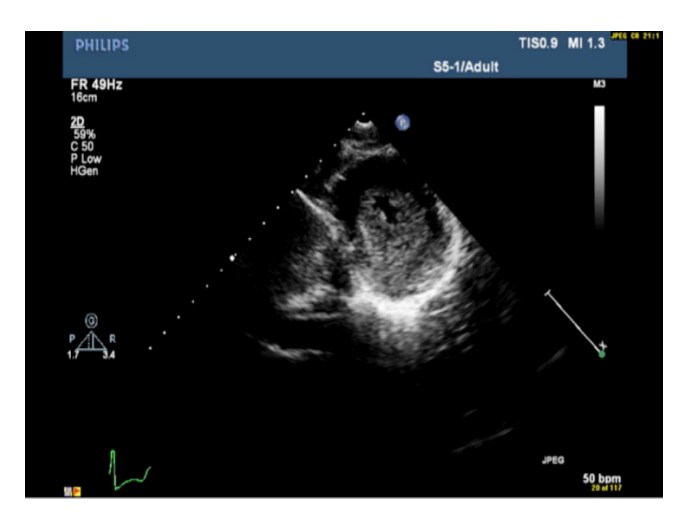
Figure 2. Short axis view of transthoracic echocardiogram showing noncompacted and compacted region of the left ventricle. The noncompacted region was more than twice the compacted region in thickness in both systole and diastole.