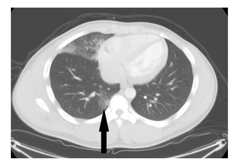
Figure 2. CT of the chest showing dense infiltrate in the right anterior lung field and a contrecoup lesion (arrow) in the right posterior lung field consistent with pulmonary contusions.