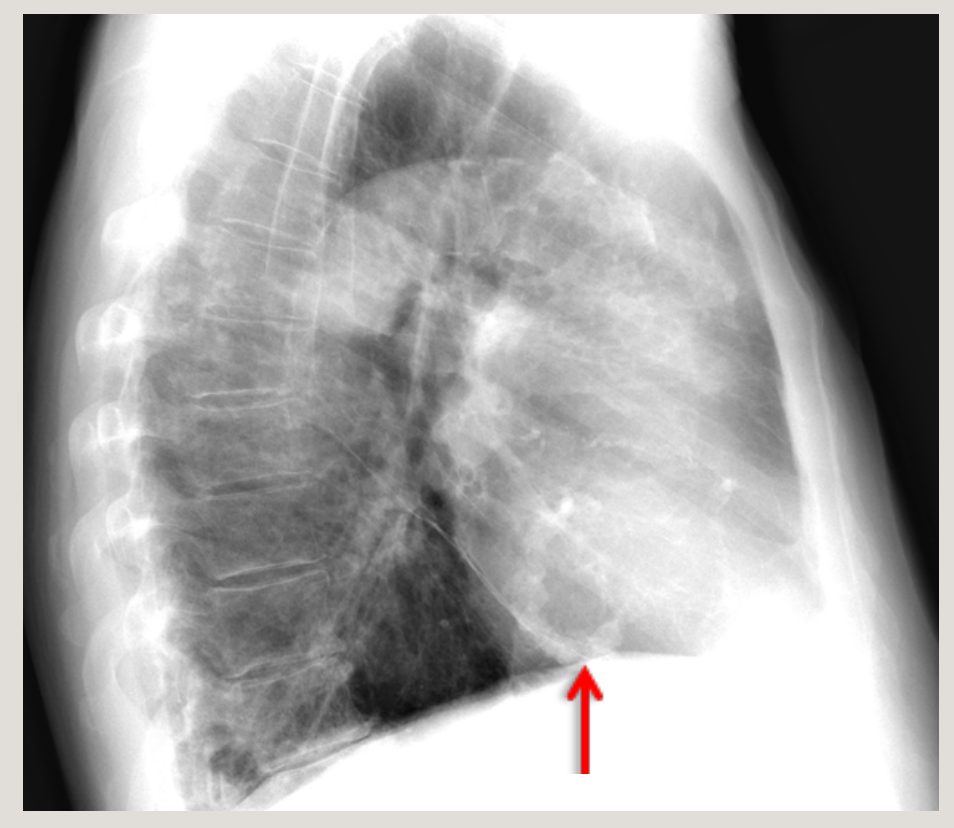
Figure 3. Lateral radiograph showing the "c" shaped calcification of the mitral annulus (arrow), located near the infero-posterior aspect of the heart.